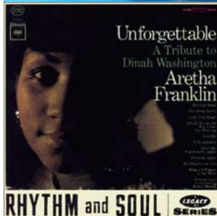
Top: Al Green and Willie Nelson Bottom: Aretha Franklin and her tribute album to Dinah Washington